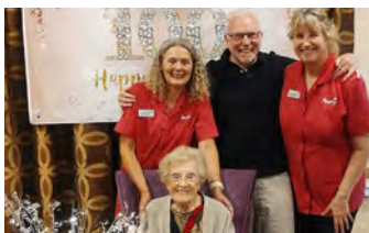
Elsie Sonning Gardens 100 th Birthday, 19 th June