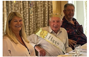
Des Chertsey Parklands Manor 100 th Birthday 3 rd September